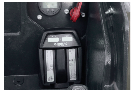
Integrated charger (optional) Charge second battery during radio operation